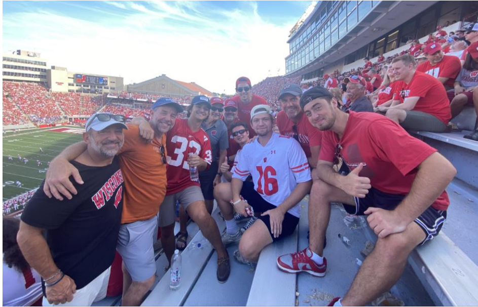
Members of our Junior class at the first football game during Dad's weekend!

In athletics, the DU football team had an outstanding regular season going undefeated but falling short in the second round of the playoffs. The basketball team is off to a good start and looks to continue it during the Spring semester. The semester was wrapped up in Chicago where the Winter Formal was held, as the brothers were able to venture throughout the city and enjoy their time together!